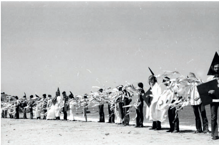
Fig. 3. Students of the Valparaíso School of Architecture and Design during a Phalène in Reñaca, 1972.