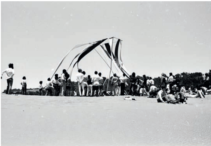
Fig. 4. Opening poetic acts of the land in Ciudad Abierta, c.1972. Archivo Histórico José Vial Armstrong, Escuela de Arquitectura y Diseño Pontificia Universidad Católica de Valparaíso.

The departure point that sets the work's origin occurs as soon as the poetic act provokes the crossing between the word and the place. This crossing reveals the places to an unprecedented destination by opening the field of its possibilities. The words that appear in the Phalène signal the place, and the action that befalls brings questions about the place. The painter Jorge Pérez-Román, who participated in several poetic experiences in Europe and South America, indicates that a fundamental characteristic of the Phalène is being able to "turn the landscape inside out like a glove" (Iommi et al., 1962: 29). That sense of surprise and astonishment, of showing things as if for the first time, is the inaugural potential of the Phalène . The poetic act reveals the place as for the first time; it is a beginning that provokes a turn in what is present there.