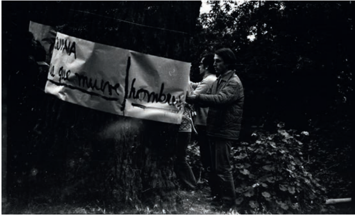
Fig. 6. Phalène in the park Quinta Vergara, Viña del Mar. 1971.