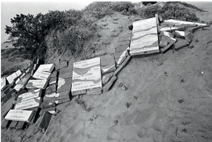
Fig. 5. A sign in Ciudad Abierta done during a Phalène in 1977.

The sign marks the new perspective of the place that emerged from its crossing with the poetic word that names its singularity. This sign can be ephemeral and quickly disappear. Its existence or realisation in no way determines the success of the Phalène since she is accomplished in the pure present moment of the poetic act. The plastic intervention of artists cyphers the newly revealed sense of place, not from the landscape, but the signification of the poetic word, the sign of the place. Then, the expressions of the poetic acts have their distinctions on each occasion, marking the unrepeatable present moment of the Phalène .